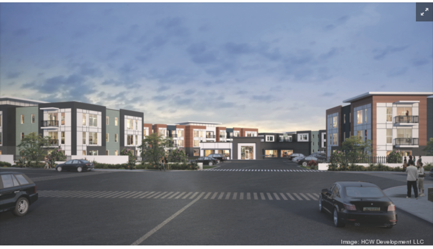
The Ballpark Village Northeast PAD with apartments, a hotel and retail development is being proposed for about 27 acres on the northeast corner of Yuma Road and Estrella Parkway in Goodyear.

Email Share In Share Tweet Share Article Print Order Reprints