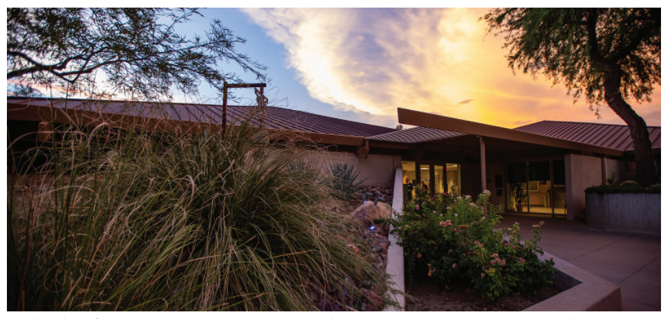
Applications for redevelopment go through scrutiny and an approval process at Paradise Valley Town Hall, pictured above.