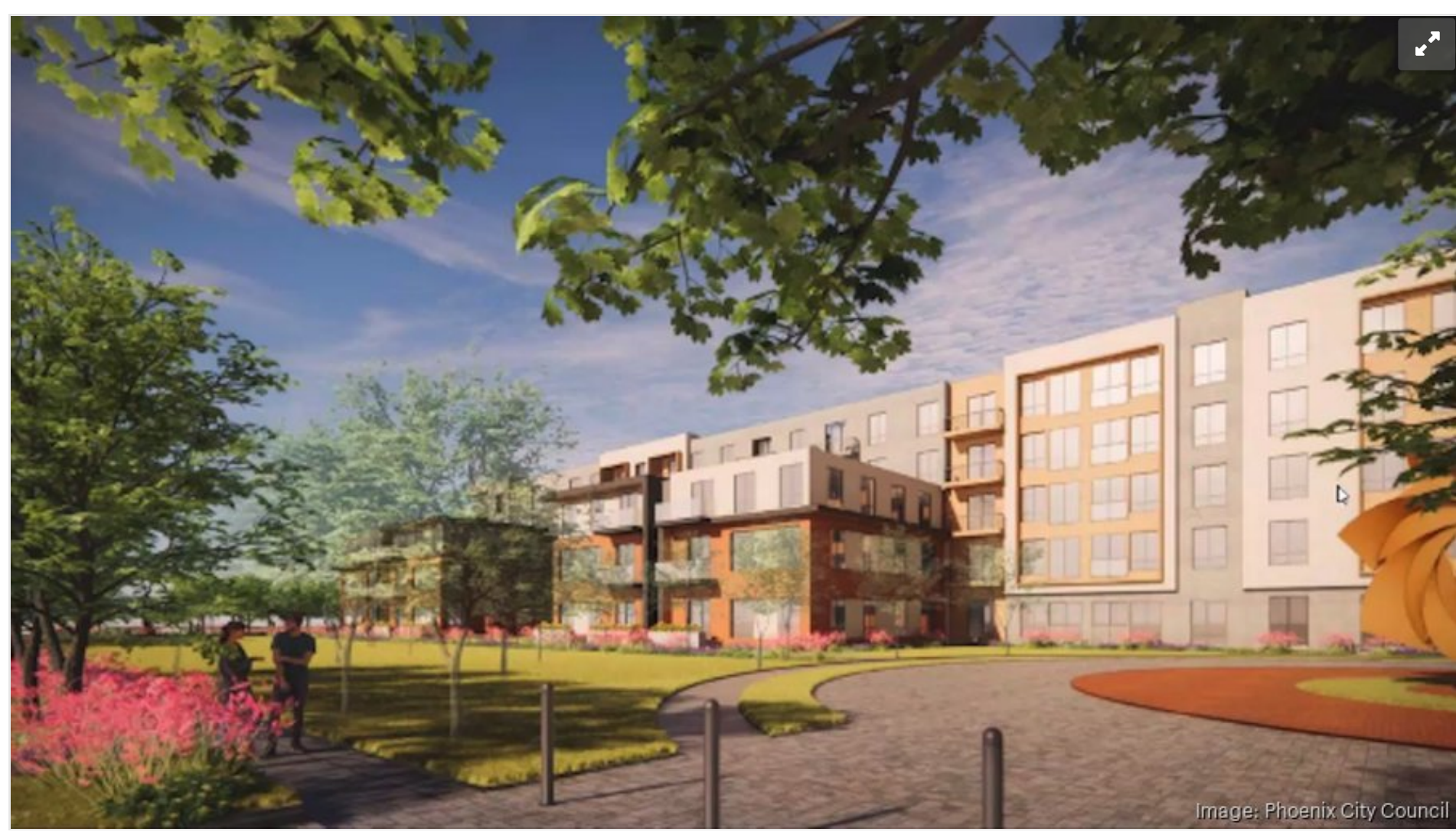
Phoenix City Council voted unanimously to approve the development of more apartment units in midtown Phoenix. PHOENIX CITY COUNCIL

EmailFacebookTwitterShare ArticlePrintOrder Reprints