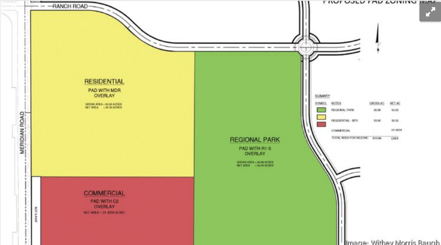
In addition to the gated rental community, the project will include 24 acres for commercial use and a 57-acre regional park.

The commercial shopping center zoned C-2 on 24.3 acres is at the northeast corner of Meridian and Queen Creek roads.