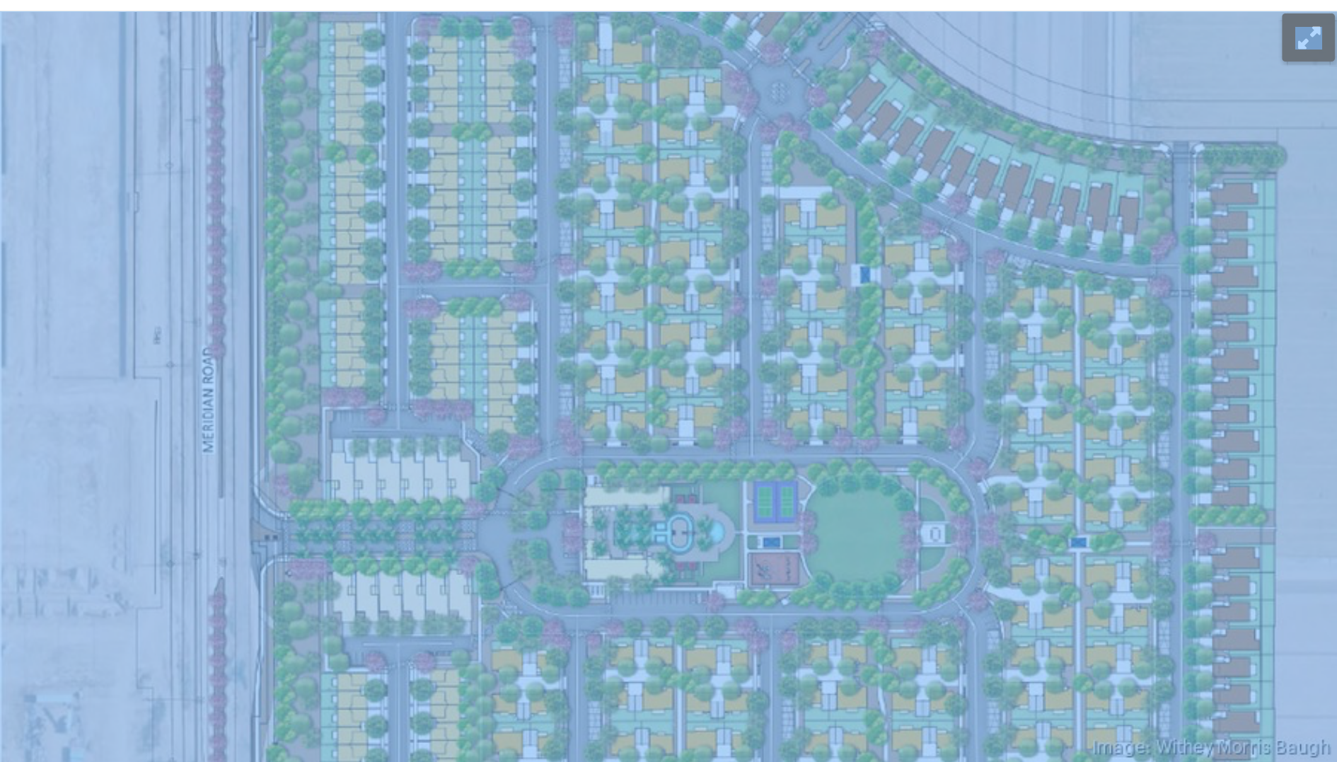
The Church of Jesus Christ of Latter-day Saints is developing a gated build-to-rent community in Queen Creek.

EmailShareShareTwitterUnlock URLPrintOrder Reprints