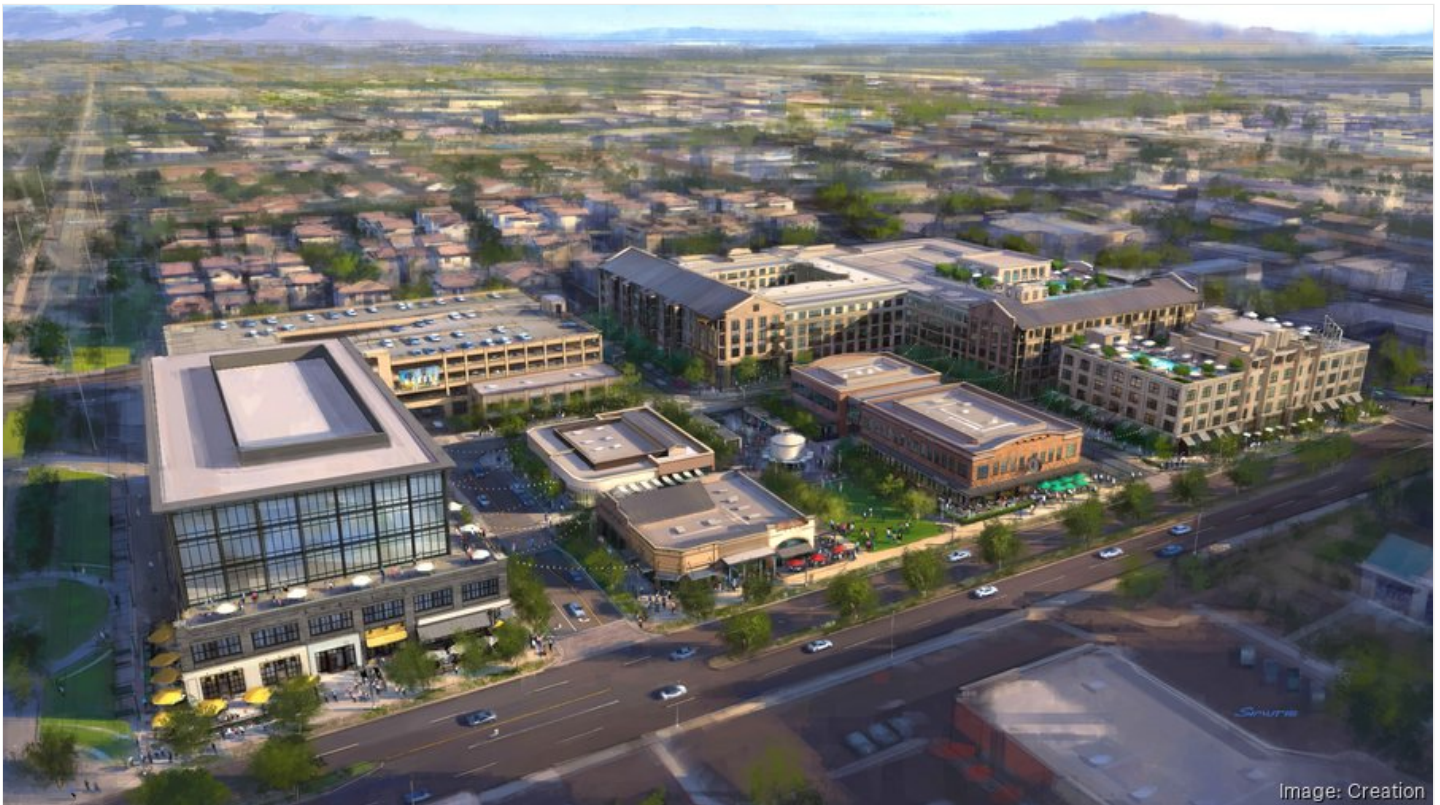
Rendering of Heritage Park in downtown Gilbert.